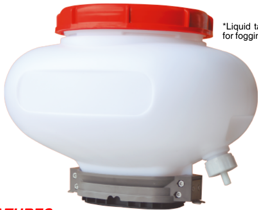
*Liquid tank accessory for fogging applications