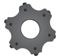
Tungsten Carbide Drum Blades