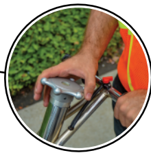
Simple Depth Crank for Lowering Blades