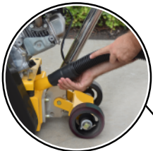
OSHA Approved Vacuum for Dust Reduction